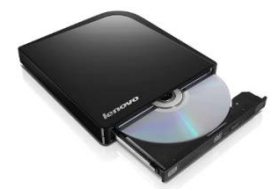
USB Portable DVD Burner