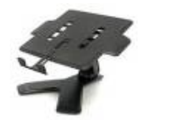
Essential Notebook Stand