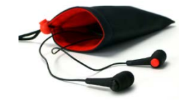
ThinkPad In-Ear Headphones