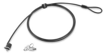
Security Cable Lock