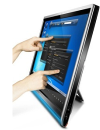
ThinkVision Monitor (HDMI input)