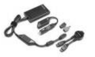
AC and AC/DC Adapters