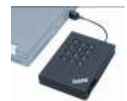
USB Portable Secure Hard Drive