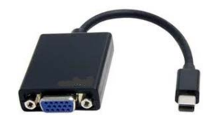
Mini-DisplayPort to VGA Monitor Cable