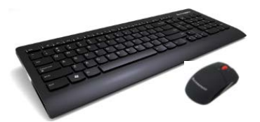
Wireless Keyboard and Mouse Wireless Mouse Bluetooth Laser Mouse