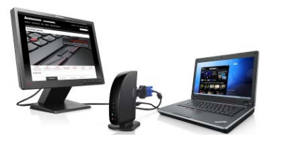
USB Port Replicator